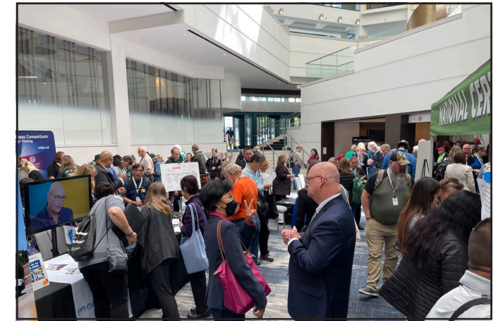
2023 National CERT Conference Exhibitor Area.

The National CERT Association (NCA) is excited to bring the 2024 National CERT Conference to Washington DC. This year, the NCA is partnering with Serve DC- The Mayor's Office on Volunteerism & Partnerships and the National Capitol Region CERT Consortium (NCR CERT). Having the conference in DC will provide the opportunity to leverage subject matter experts from FEMA, which is headquartered in Washington DC, at this year's conference.